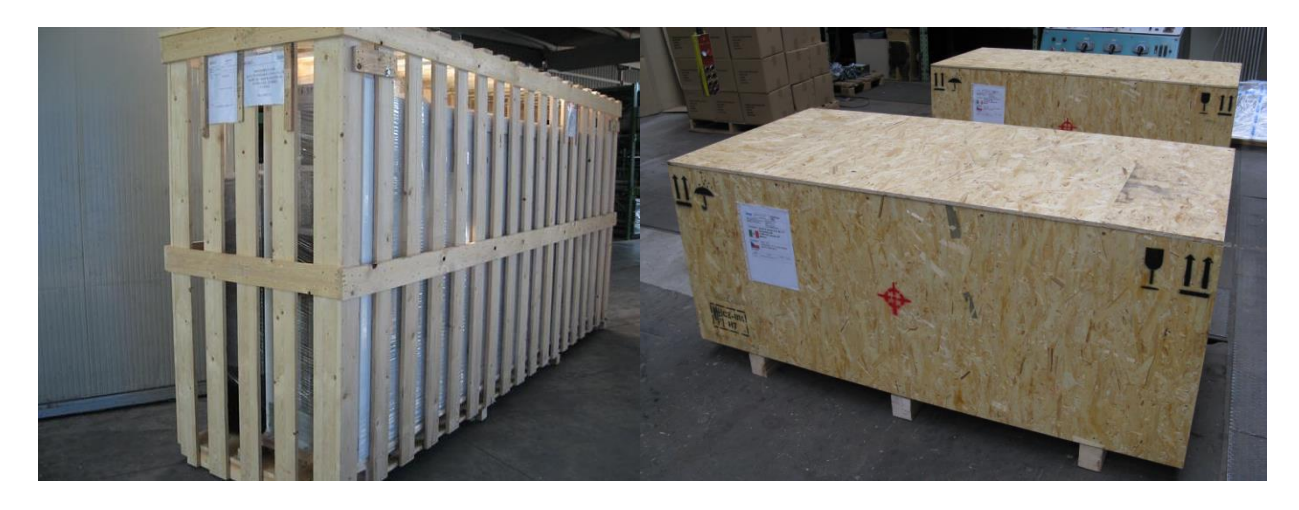
Wooden crate, wooden box

According to the various arrangements the switchgear cabinets are either placed on wooden pallets or directly on the cabinet's own steel frames, which in this case are not dismounted. The switchgear cabinets cannot be stacked. They are packed in plastic film with corner reinforcements. Sometimes, which applies for seaworthy packing, the cabinets are placed in wooden crates or boxes.