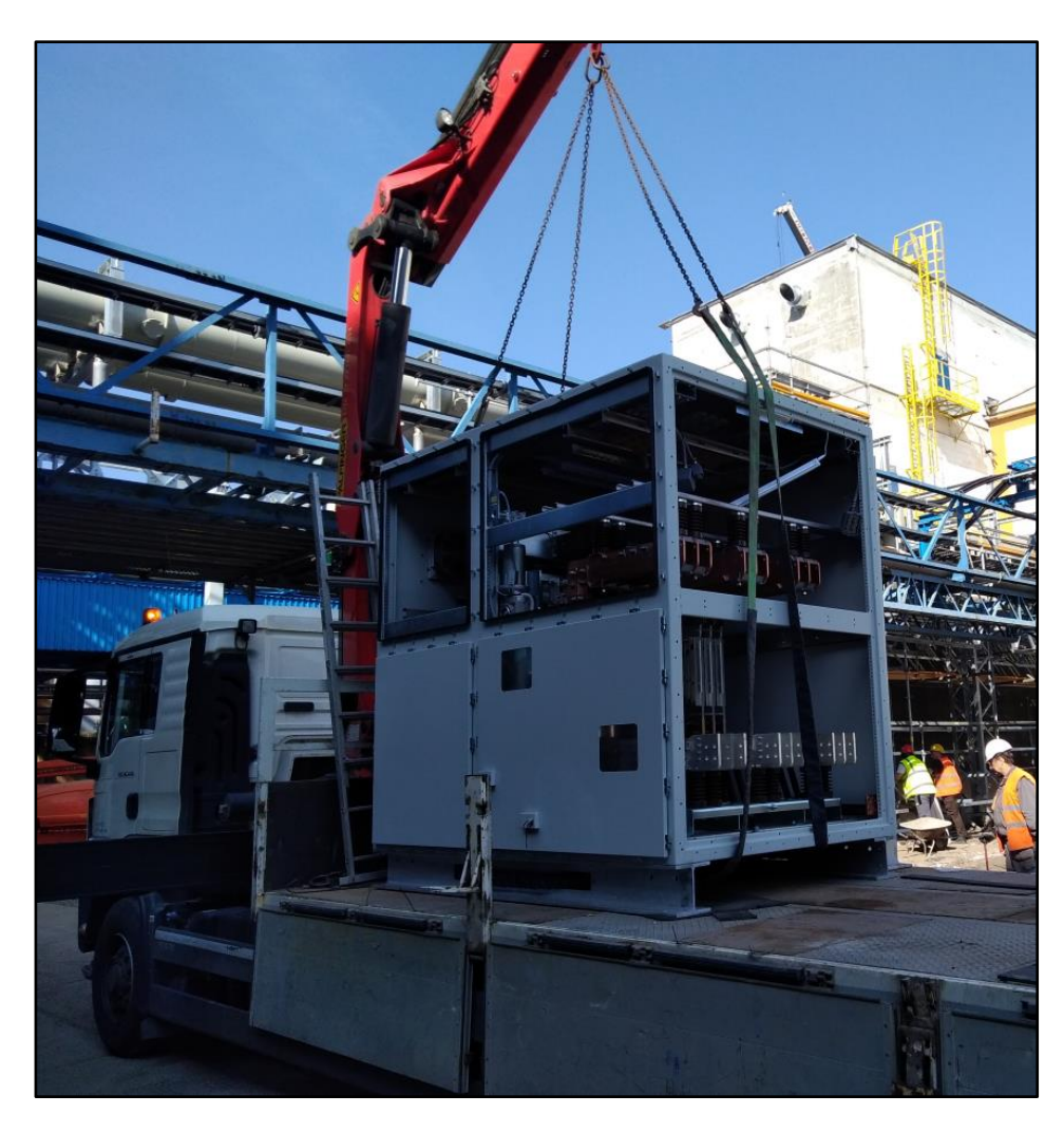
Lifting the switchgear cabinets by rope