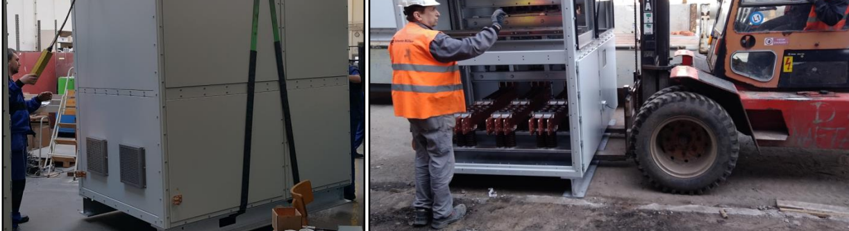
Examples of lashing and lifting the switchboard cabinets