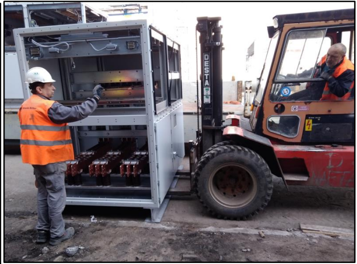
Examples of lashing and lifting the switchboard cabinets