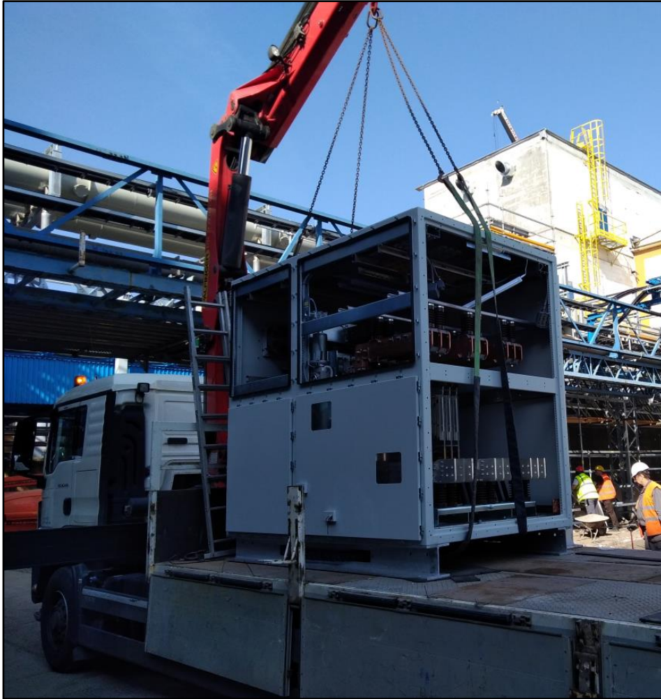
Lifting the switchgear cabinets by rope