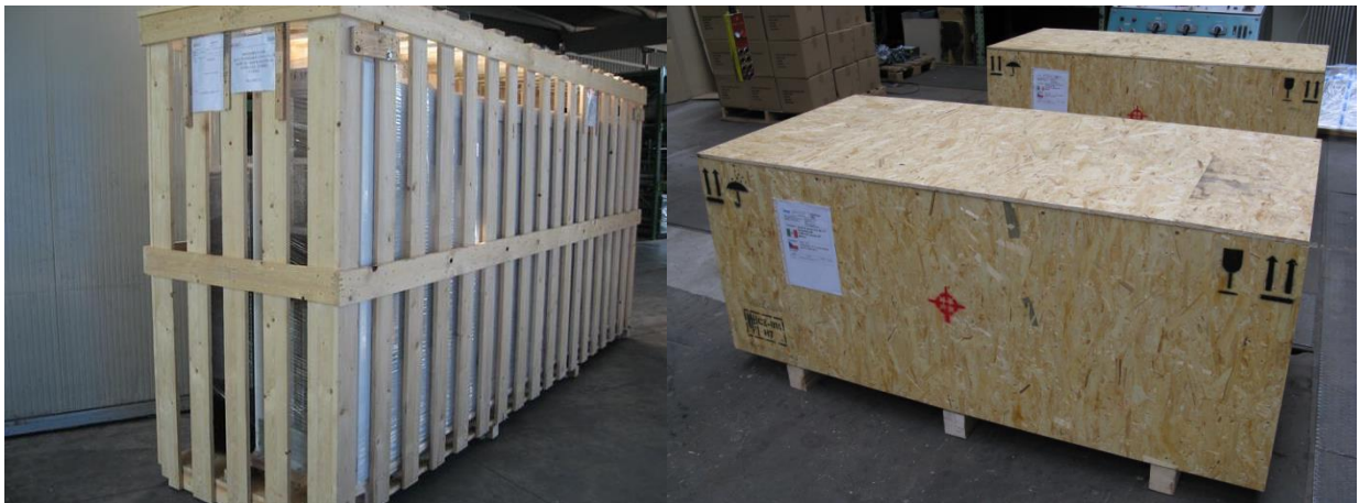
Wooden crate, wooden box

According to the various arrangements the switchgear cabinets are either placed on wooden pallets or directly on the cabinet's own steel frames, which in this case are not dismantled. The switchgear cabinets cannot be stacked. They are packed in plastic film with corner reinforcements. Sometimes, which applies for seaworthy packing, the cabinets are placed in wooden crates or boxes.